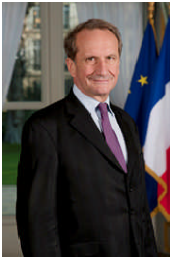
Gérard LONGUET Minister of Defence, France

Gerard Longuet was born on February 24th, 1946 in Neuilly sur Seine (close vicinity of Paris).